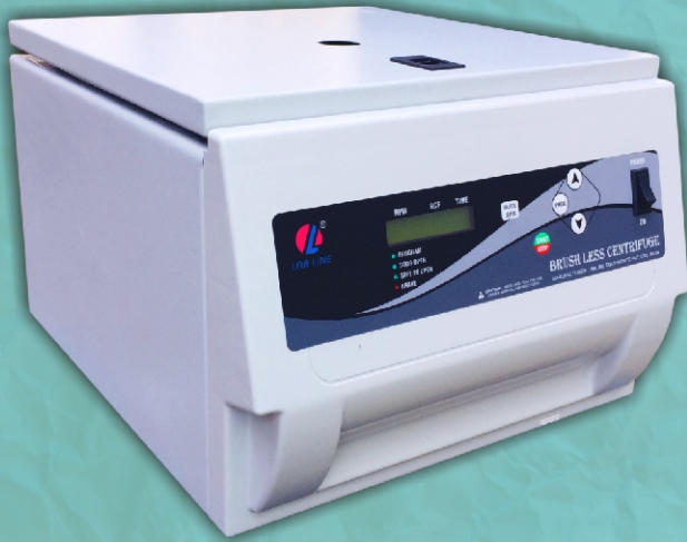
Model :- CF-888