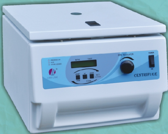
Model :- CF-600