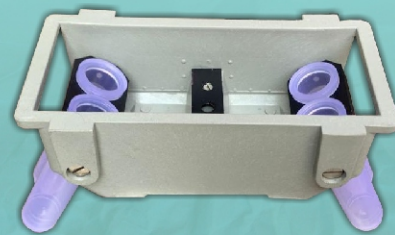
Model :- PRP - 02