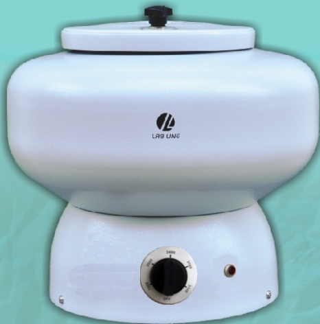
Model :- CF-513