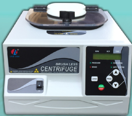
Model :- SC-101